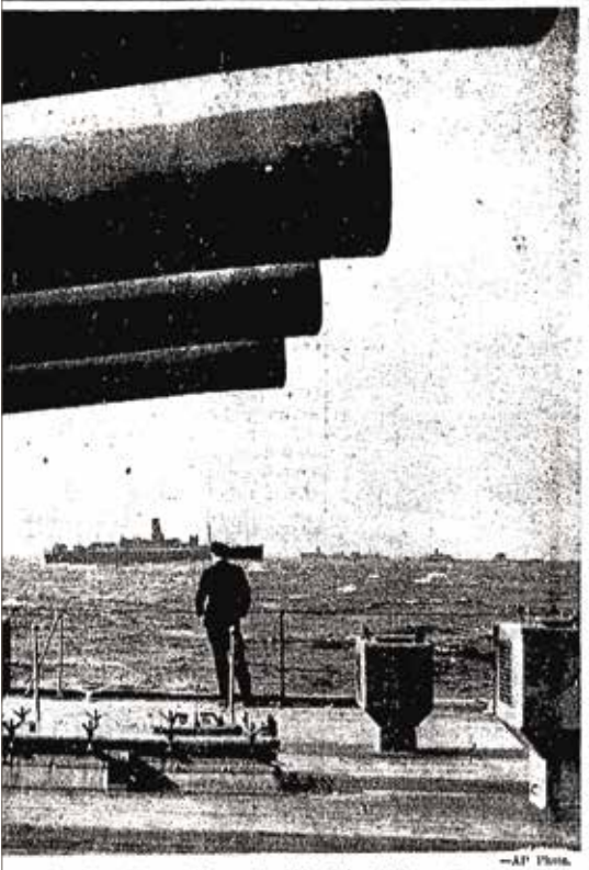
ns of the Escorting Battleship King George V

Richmond Times-Dispatch, Friday, July 18, 1941