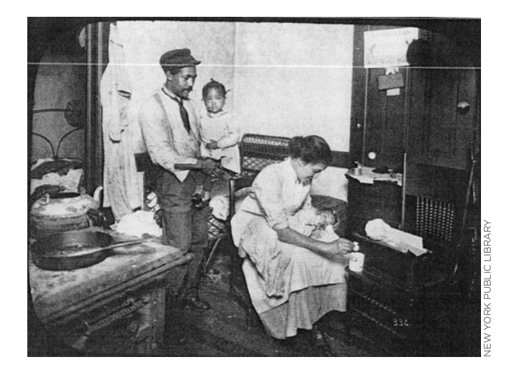
Top, New York's Lower East Side circa 1918 Above, a visiting nurse from the Henry Street Settlement

s New York responds to an overwhelming rise in COVID-19 cases, nurses are on the front lines. Some are in hospitals; others outside in the community, making home visits and manning phone lines. A look back at what happened in New York during the influenza pandemic of 1918 tells a similar story.