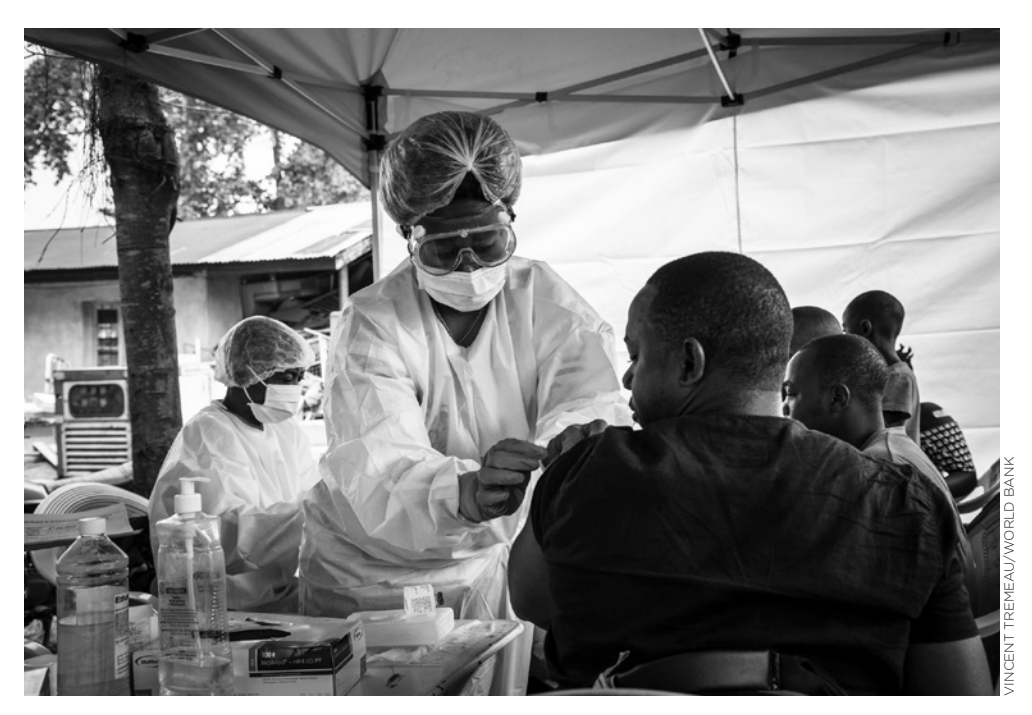
A nurse in the Democratic Republic of Congo vaccinates a man who has been in contact with an Ebola-affected person.

When they found themselves in conflicting situations that pitted their professional ethics against their own or their family members' personal safety, they made decisions guided by their duty to care.