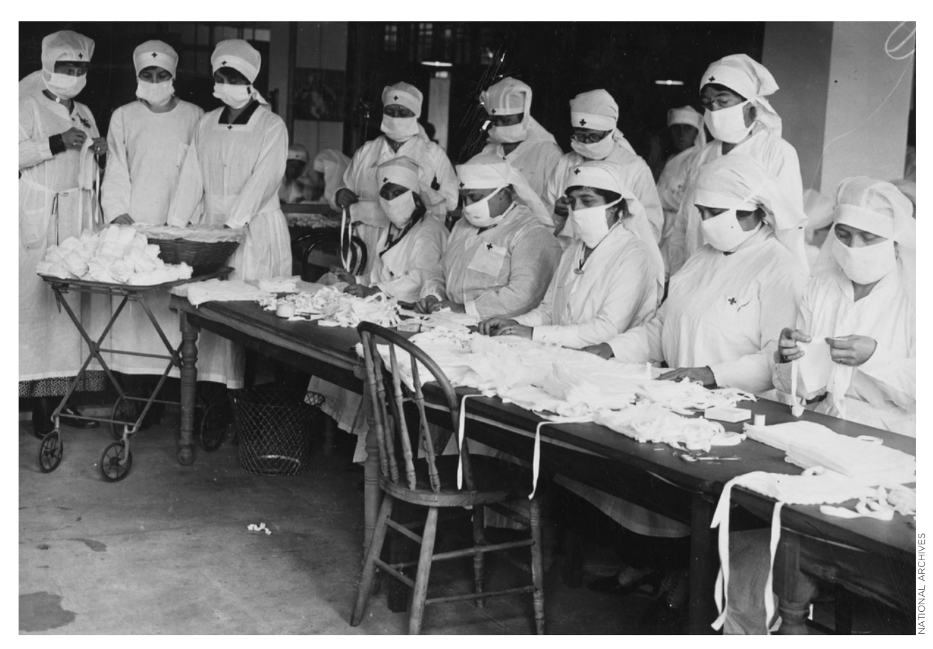
Mask-making during the influenza pandemic a century ago

become even more complex in politically sensitive areas and impact responses by domestic and international relief agencies. When individuals, governments, and private organizations respond, humanitarian interests abound, but relief measures are not apolitical. I invite you to read about this in our journal Health Emergency and Disaster Nursing, Vol. 5, 2018, as we explore issues after the Taiwan earthquake in 1999 when disputes between China and Taiwan influenced the allocation of domestic and international aid. Different geopolitical forces, and particularly religious issues, were in operation during the Syrian civil war, which began in 2016. Other articles consider the earthquakes in Nepal and Haiti when certain groups obtained help while others did not.8