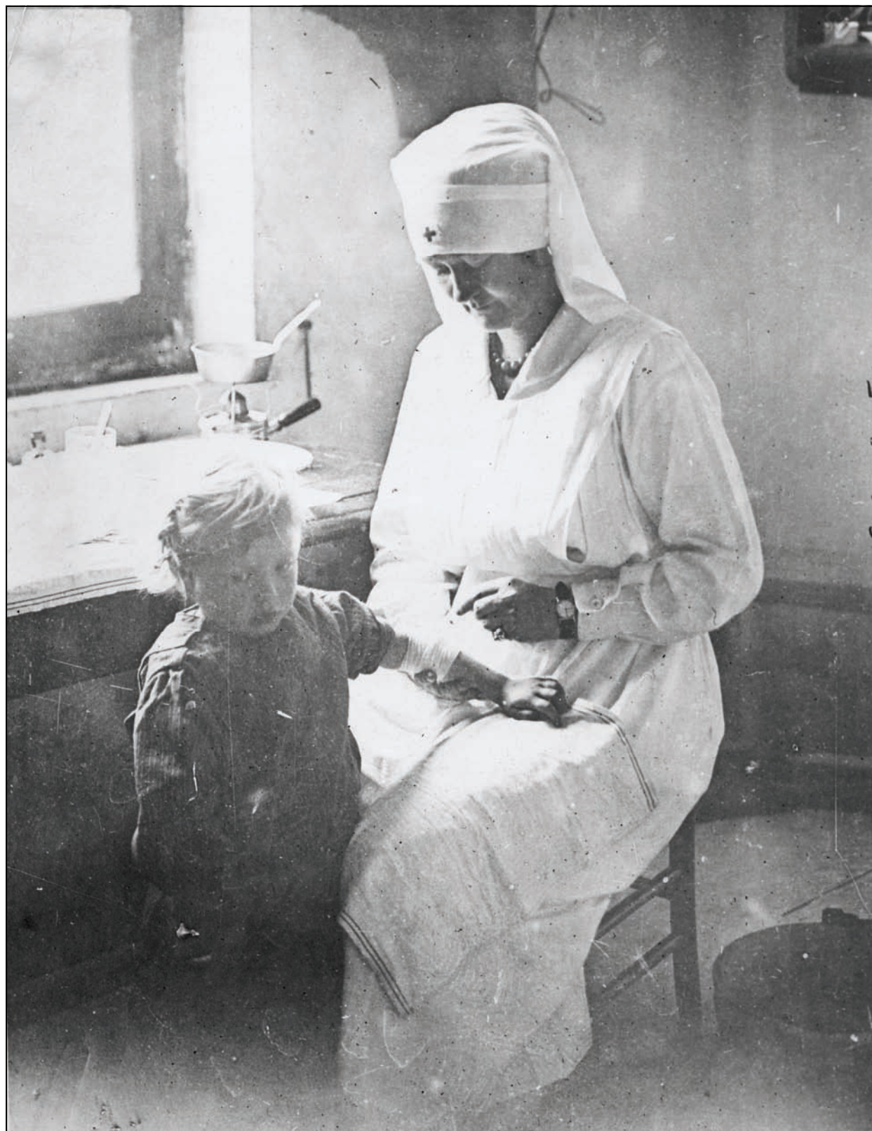
American nurse caring for French child, 1918.