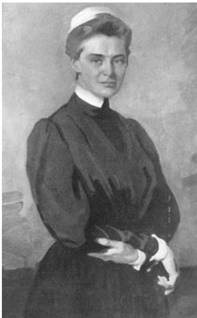
Adelaide Nutting, 1858-1948 from the 1906 painting by Miss Cecelia Beaux

The University of Virginia Health Sciences Library Historical Collections recently donated a unique historical collection to the CNHI. The gift contains microfiche and microfilm with topics related to the history of medicine and nursing. This collection is a rich resource for scholars of medical and nursing history. The history of nursing collection includes the Adelaide Nutting collection which contains every volume of her library in its entirety. The archives of the Department of Nursing Education, Teachers College, Columbia University are also included in this collection; all of the papers of the Department of Nursing Education are scanned and available. Early American medical imprints dated 1668-1820 and medical periodicals, all of which are in full text, are also included in the collection. A microfilm/microfiche reader was included with the gift.