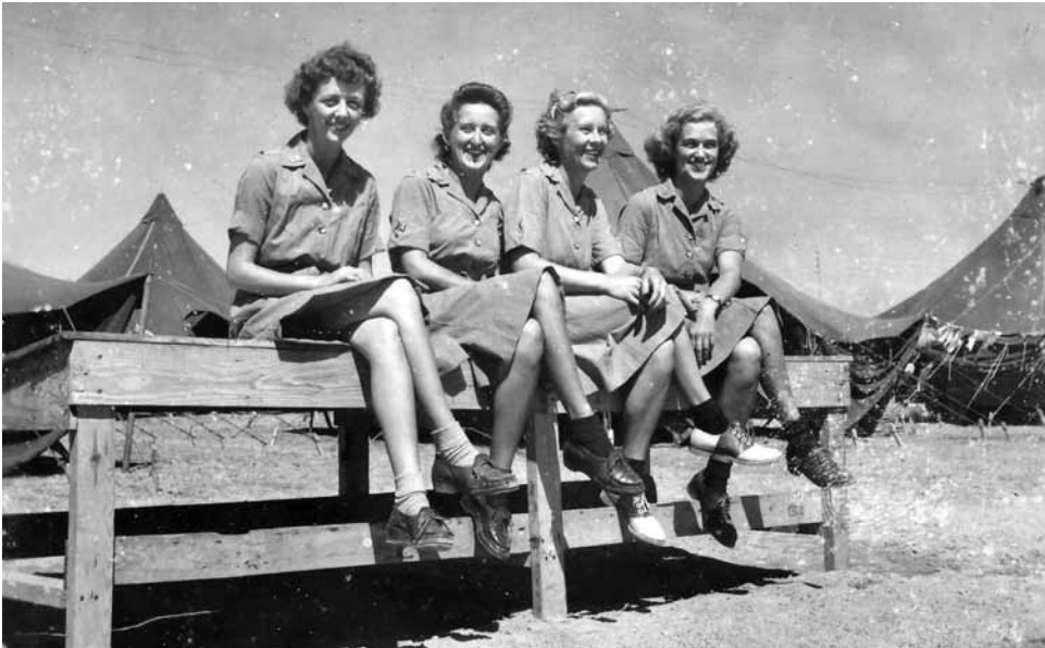
CNH ALICE HUFFMAN BIGEEL COLLECTION