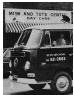
Mom & Tots Center Bus

The “B” on the window was a signal, a mark that indicated that the community recognized the clinic as a “soul brother.” As Milio noted: “The building was not to be touched as it belonged to the people there.” 7 Clearly, the neighborhood community was invested in the Center and did not want it destroyed. Thus, Milio’s dream had come true: the new clinic, involving women from the inner city neighborhoods where she had first practiced public health nursing, had become a center where the women felt at home—where they felt supported by others and committed to its success.