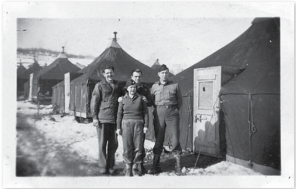
In the snow