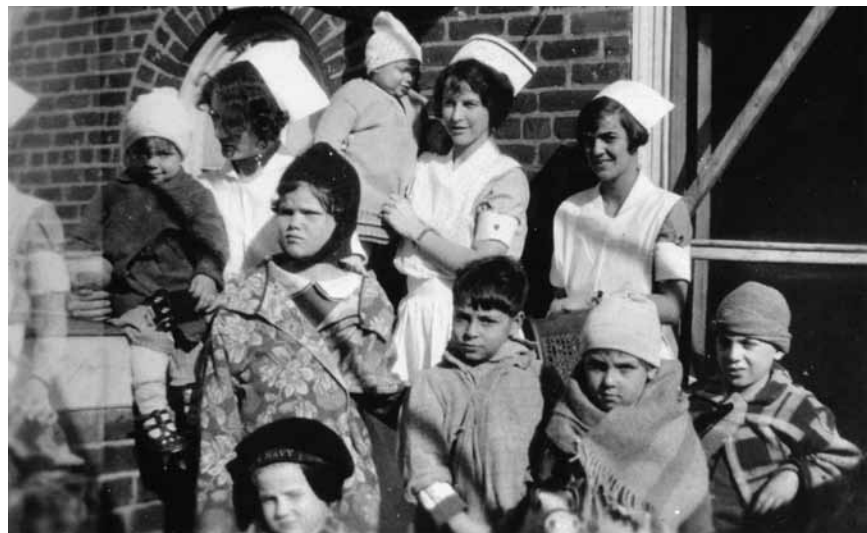
U.Va. pediatric patients taking the air, c. 1920s