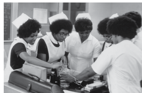
CNHI SCHOOL OF NURSING COLLECTION

Accommodation of 100 rooms is reserved for conference delegates at the Hotel Koldingfjord, a four-star hotel located next to the museum. See www.koldingfjord.dk/gb . Those wishing to take advantage of this special rate should reserve accommodations before May 8, 2012. Regular prices for accommodations will apply after this date. Bookings of rooms are now open. When booking, please notify the hotel that you are attending the International Nursing History Conference. Further information about the conference fee and program will be available when registration for the conference opens on January 16, 2012 on the conference website, www.dsr.dk/dshs .