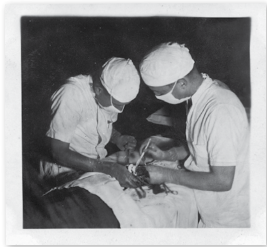
Surgeons at work.

After eventually obtaining additional necessary equipment, the 8th Evac established a fully functional field hospital at Caserta, near Naples, Italy from October to December, 1943. During this time, members of the unit worked together to devise new and innovative uses for equipment and improved methods for providing care. For example, German ammunition cases were converted into scrub sinks for the operating rooms. 29 Despite frequent air raids and blackout conditions, the morale of the unit was high. Kinser stated that “Most everyone [was] quite happy and pleased at [the] set up ... [the] meals [were] excellent and the cognac [was] very good.” 30 More than 7,000 hospital patients and outpatients were cared for in this two month period. The time at Caserta would later be considered “light duty” by the members of the 8th Evac in comparison to the work they