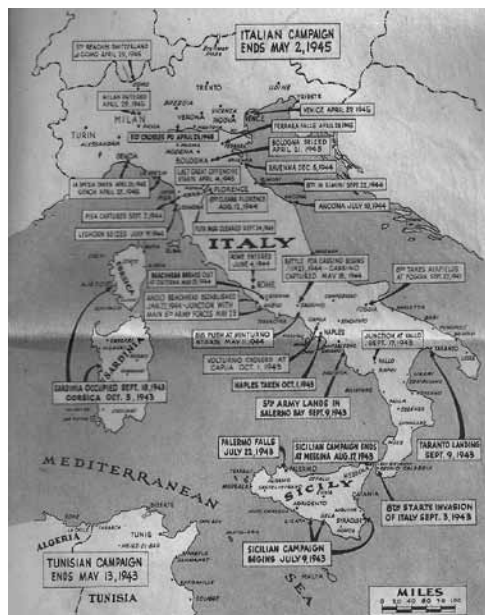
The Italian campaign