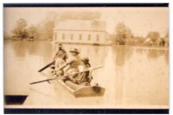
Scene from the 1927 Mississippi Flood, Courtesy Jeanette Waits.

whooping cough and the danger of typhoid, malaria and other epidemics. Literally tons of quinine was administered in an effort to prevent malaria and thousands were inoculated daily against smallpox and typhoid. ... Nurses frequently went from house to house in boats, caring for those who