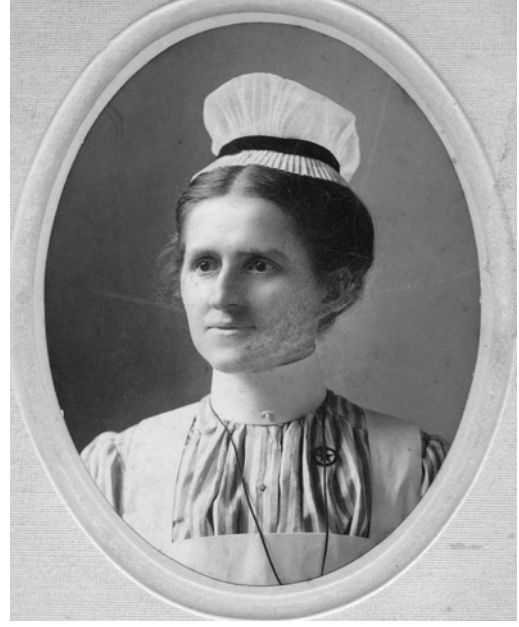
Springfield, IL, c. 1900s.

"The nurse's work is to do what is necessary for the patient, give treatments, keep her records; and if the inefficiency or negligence of others obliges her to supplement her work by doing some of theirs in order to insure the recovery of the patient, she should not maintain rigid rules at the expense of her charge. The difficulties associated with fulfilling this goal however, are often compounded by families' ignorance of the