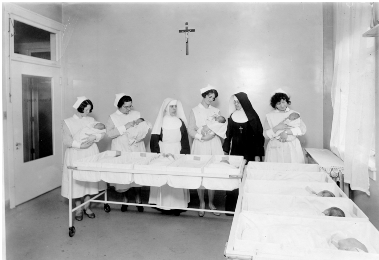
St. Charles Hospital, Aurora, Illinois, c. 1928-29.

NON-PROFIT ORG. U.S. POSTAGE PAID CHARLOTTESVILLE, VA PERMIT NO. 164