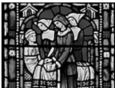
From the National Cathedral's Florence Nightingale Window.

A bus filled with enthusiastic students, alumni, faculty, and friends traveled to the Cathedral to join