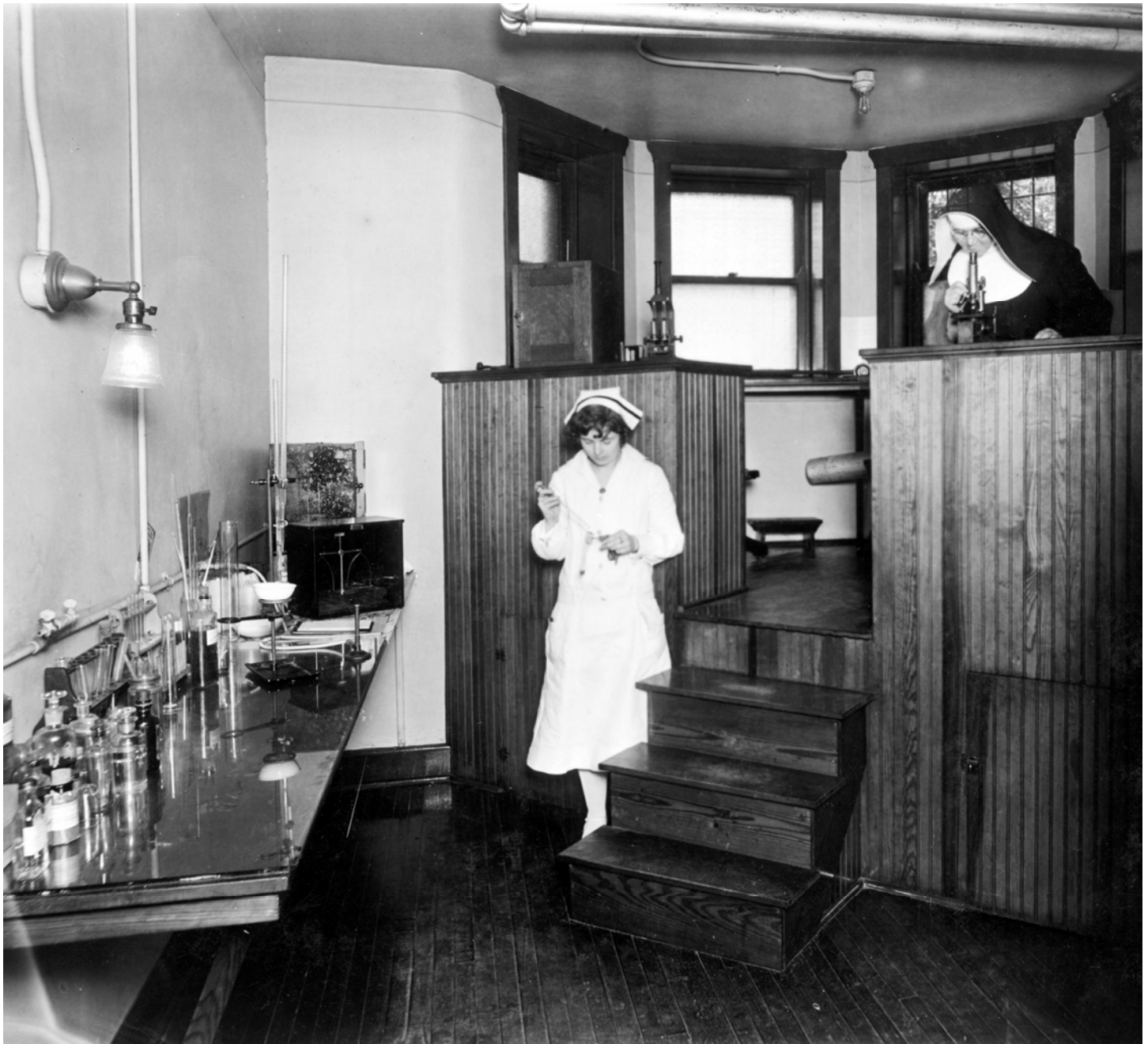
St. Charles Hospital, Aurora, Illinois, c. 1928-29. CNHI Stella Prombo Renaud Collection.